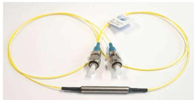
Alternative configuration – Bragg-mirror coated on the fiber end, butt coupled to another fiber, and mounted in a steel tube.

Bragg mirrors for other wavelength, reflectance, and / or fibers can be designed and delivered as well, please ask!